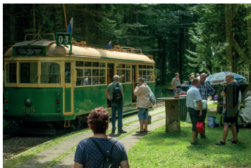
The Tramway Museum Skjoldenæsholm

Follow the red line from the town square or jump on tour route, where you like.