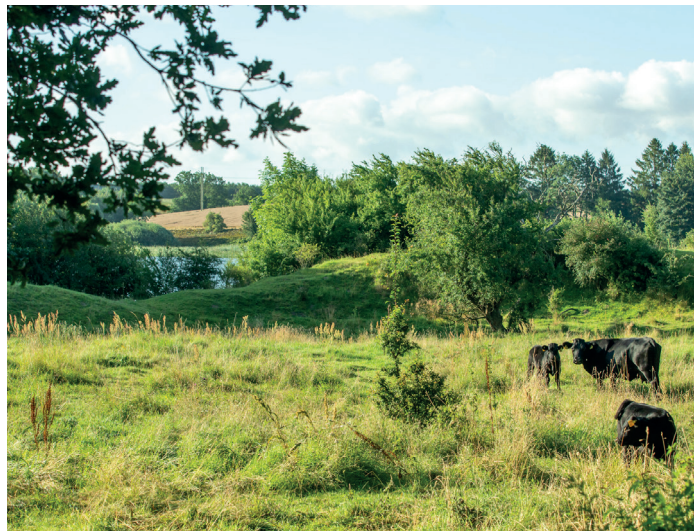
The semicircular Riding Arena

Continue straight through Vrangeskov (forest) towards Valsømagle. At the T-junction continue to the right on Valsømaglevej.