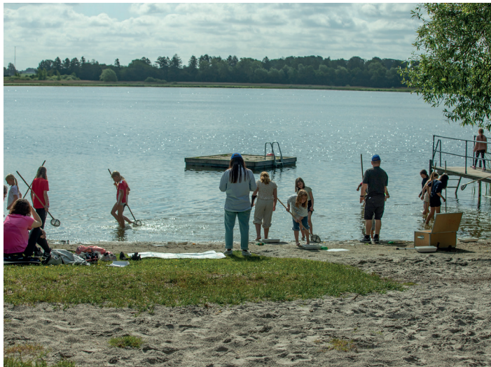
Blue Flag beach Haraldsted Lillesø

In Haraldsted you will pass Haraldsted church on your left.