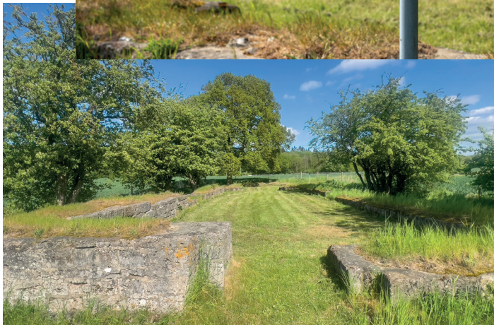
Knud Lavards chapel

Scan the QR code and download more cycling routes and tourist brochures.