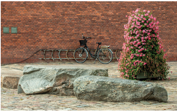
3 stones where important descisions were made by Danish Monarchs.

The trip starts at the town square. In front of the Town Hall you will find the 3 stones 'Tingstenene' where important decisions were made by Danish monarchs who were subsequently laid to rest in the beautiful church of St. Bendts.